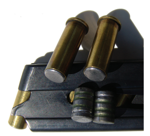
The five-cartridge P240 magazine shown with home-casted RCBS .38 SPL WC (ref 82030) bevel base and nose, resized .357 and lubed.

To dismantle the P240, you have to remove the barrel-slide lock, which is done by first removing the magazine and checking that the pistol is safe with an empty chamber. With the right hand embracing the top of the slide, retract it by about 10mm. Insert the multitask Hammerli tool between the slide muzzle and the protruding recoil spring end. With this tool in place, relax the slide until the rear end is even with the frame. Extract the barrel-slide lock lever from the left, remove the special tool and push the ensemble 'slide-barrel-recoil spring and rod' forward out of the frame. Now you may separate the recoil