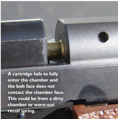
A cartridge fails to fully enter the chamber and the bolt face does not contact the chamber face. This could be from a dirty chamber or worn-out recoil spring.

having difficulties chambering your rounds? Does the (bolt) breech close properly against the chamber after chambering a new round without applying due force? Have you experienced a 'dead' trigger and no shot? Have you noticed the rear of the case protruding from the chamber? Is the round set properly against the chamber face? This would come mostly from crud accumulating at the bolt face or at the breech (chamber face), leaving the rim of the cartridge unsupported.