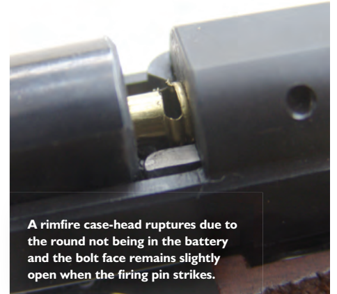
A rimfire case-head ruptures due to the round not being in the battery and the bolt face remains slightly open when the firing pin strikes.

Similarly, repeated firing leaves carbon residues, especially if the chamber is on the saggy side. Powder residues and carbon accumulate on chamber walls without regular cleaning. When cleaning the chamber, be careful not to damage the rifling. Use a dedicated .22LR bore brush, preferably of nylon to start with or all bronze. Do not use steel at all in the chamber or on the rifling.