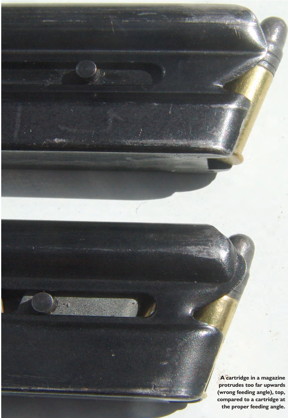
A cartridge in a magazine protrudes too far upwards (wrong feeding angle), top, compared to a cartridge at the proper feeding angle.

As an example, the following recommended adjustments are only valid for the High Standard Military pistols that have no feeding ramp. Other .22LR self-loading pistol magazines may have different adjustments. If you do have another pistol, do not attempt to adjust with these specifications. Buy a new original magazine for your firearm.