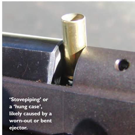
'Stovepiping' or a 'hung case', likely caused by a worn-out or bent ejector.

If you experience an occasional misfire, it is likely a bad cartridge. No mercy, throw it away! If you have frequent misfires, the chamber may still be dirty with crud accumulated at the breech and elsewhere. Clean it up again. Then check that