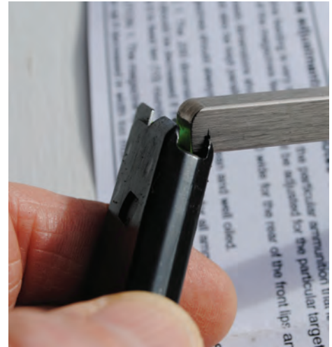
Special pliers to adjust the lips on the High Standard magazine.

Do your spent cases extract but not fully eject? Do they get caught upright or sideways between the bolt and the chamber? This is a 'hung case' or what is called 'stovepiping'. If it happens often, the reason may be a loose or bent ejector that negatively affects the backward and forward motion of the bolt, causing problems with extraction, ejection or feeding. This may also be caused by 'weak' ammunitions or a faulty recoil spring or rod. Test other ammunition brands and if it is not resolved, consult your gunsmith.